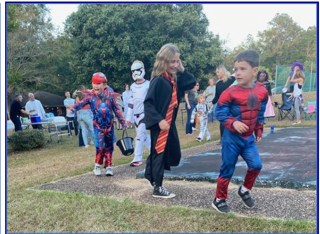
The costume parade was a great hit!