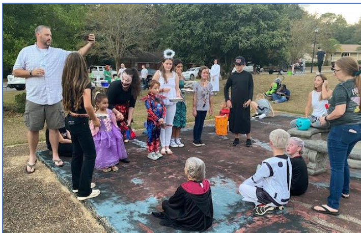
A team competition game is about to begin